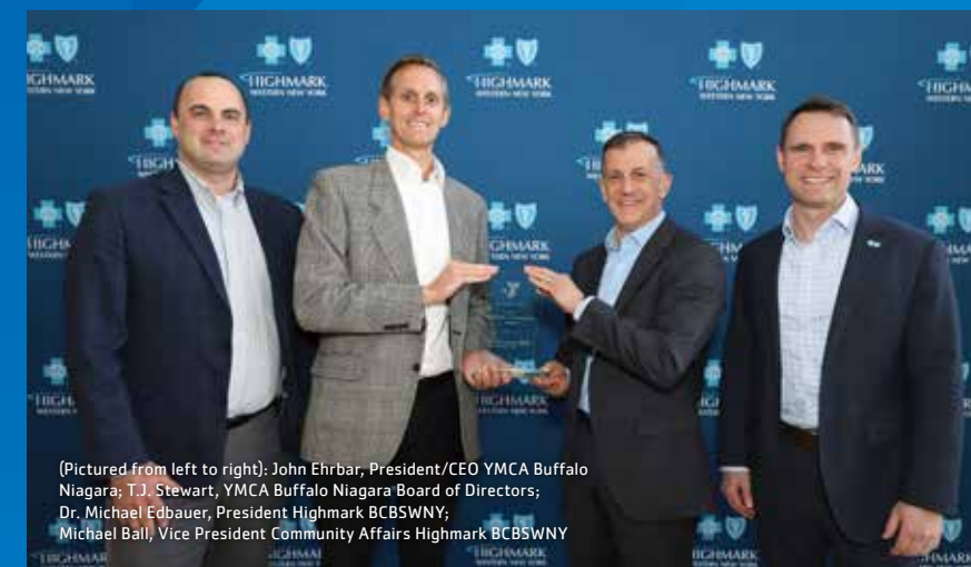
Congratulations to 2021 Stewart Partnership Award Recipient

Thanks to the generosity of our donors and community partners, we are able to make life-changing YMCA programs accessible to those who may otherwise be unable to afford them. As a charitable, non-profit organization, we allocate funds to help all people reach their full potential.