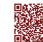
For a list of YMCA Buffalo Niagara's major donors please visit YMCABN.org or scan this QR code.