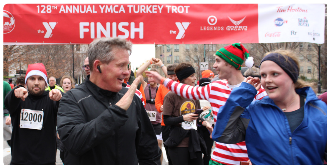
The YMCA Turkey Trot continued as the longest consecutively run footrace in North America, welcoming 14,000 participants. We are grateful to the sponsors, volunteers, and participants, as well as those who contributed over 4,400 pounds of food to help combat hunger in Western New York.