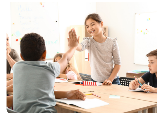
YMCA Buffalo Niagara launched an After School Socialization Program for children diagnosed with Autism Spectrum Disorder at John A. Sciole Elementary School (Lancaster) in collaboration with the Institute for Autism Research at Canisius University.